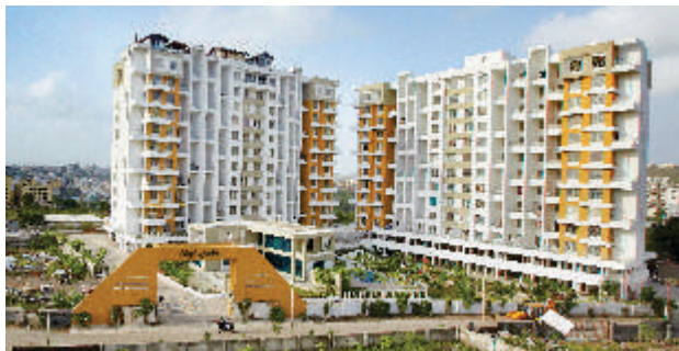
Meghsparsh, S. No. 101/10, Mumbai-Bangalore Highway, Ambegaon (Kh.), Pune.