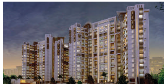
Paritosh, S.No. 31/32, Behind Mitcon, Balewadi, Pune.