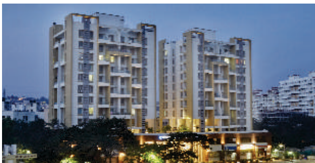
Spandan, S. No. 117/1, Popular Nagar, Mumbai-Pune Bypass, Warje, Pune.