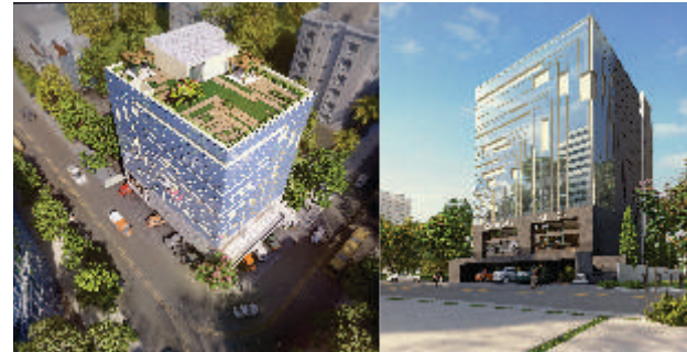
Metropolis, S.No. 22/3 Part, Balewadi, Pune.