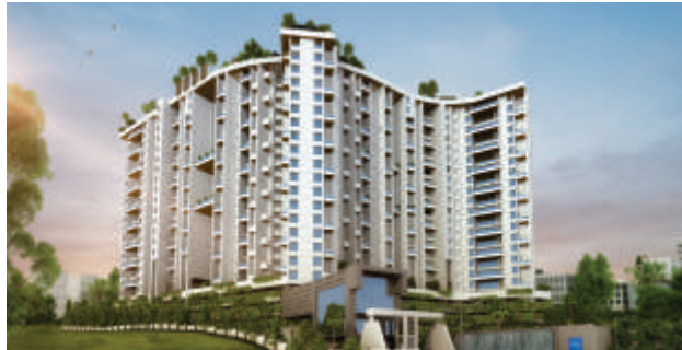
Akashparv, S.No. 15, Chandni Chowk, Bavdhan, Pune.