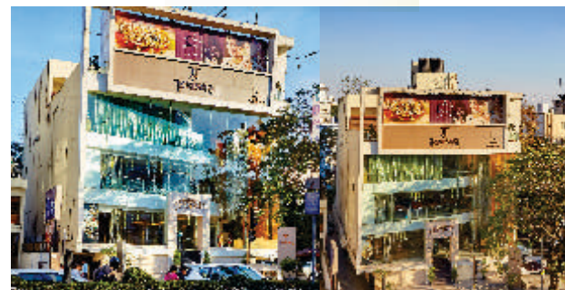
Times Square, C.T.S. No. 30, Bund Garden Road, Pune.